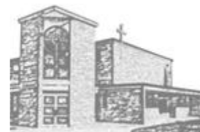
St. Ann, Slayton

Sunday Masses Sat 5:00 pm St. Ann Sun 8:00 am St. Columba Sun 10:00 am St. Mary