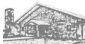
St. Columba, Iona

Confessions Sat 4:30 pm St. Ann Sun 7:30 am St. Columba Sun 9:30 am St. Mary Tues 4:00 pm St. Ann