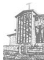
St. Mary, Lake Wilson

Mailing address for all parishes 2747 29 th St Slayton, MN 56172