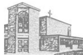
St. Ann, Slayton

Sunday Masses Sat 5:00 pm St. Ann Sun 8:00 am St. Columba Sun 10:00 am St. Mary