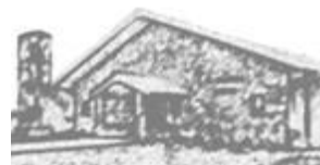
St. Columba, Iona

Confessions Sat 4:30 pm St. Ann Sun 7:30 am St. Columba Sun 9:30 am St. Mary Tues 4:00 pm St. Ann